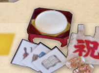
▲ Issho-mochi Ceremony

To pray for your child's healthy growth and not having to worry about food for the rest of his or her life, we can serve to prepare for Weaning Ceremony and Issho-mochi (1.8 kg rice cake) Ceremony for the first birthday. Also a party cake is available for your memorial trip.